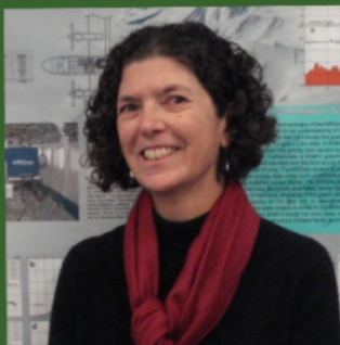
Margie Turin Leadership Award