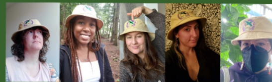
Feminist Bird Club Environmental Impact Award

A VARIETY OF AWARDS ARE PRESENTED BY NYSOEA EACH YEAR TO ACKNOWLEDGE THE ACHIEVEMENTS AND CONTRIBUTIONS TO NEW YORK STATE OUTDOOR EDUCATION.