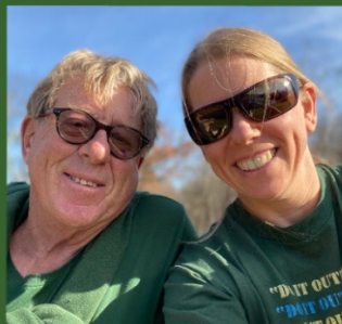
Marty Strong Presidential Award