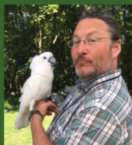
Eric Powers Outdoor Educator Award