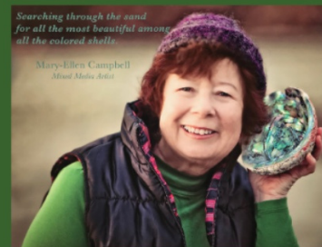
Mary-Ellen Campbell Art & Literary Award